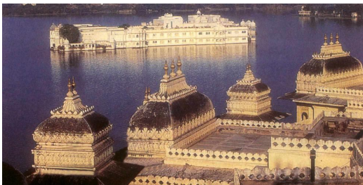
Lake Palace, Udaipur