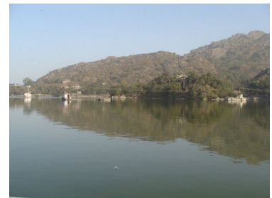
Nakki Lake, Mt. Abu