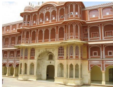
City Palace, Jaipur