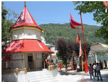
Naina Devi Temple.