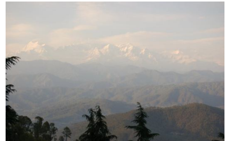
View of Himalayas.