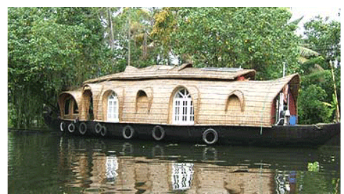
Houseboat at Alleppy.